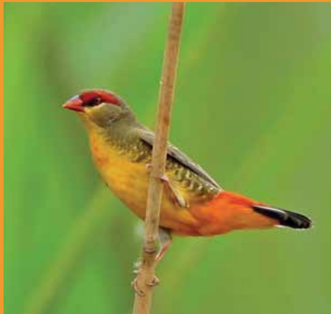
Orange-breasted Waxbill

The purpose of the ride - Recent unexpected declines in Africa's smallest finch, the Orange-breasted Waxbill, has resulted in the need for the species to be researched. Not yet listed as threatened BirdLife South Africa has now selected the species as a key sentinel (watchdog) species for no less than eight threatened bird species and 84 common bird species that all use a similar wetland habitat to itself . It's a small bird with BIG responsibilities.