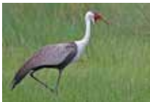
Critically Endangered Wattled Crane