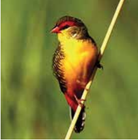
Orange-breasted Waxbill The research data will benefit eight threatened species