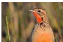
Near Vulnerable Rosy-throated Longclaw