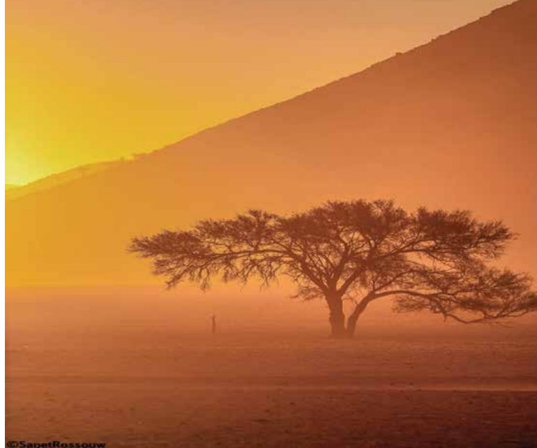
A desert storm in Namibia

On 19 February 2017 Eelco Meyjes will start his small is BIG fundraising cycle ride. The target is R300,000. The distance will be 3600km. It will AGAIN be an unsupported solo cycle ride. It will start in Cape Town, cross Namibia and go across the top end of Botswana and end at the mighty Victoria Falls. He hopes to complete the ride in 67-70 days. A major new challenge for him will be to try and cross large sections of the Namib Desert. Managing water supplies, cycling on soft sand, cycling on long stretches of corrugated dirt roads and avoiding desert storms will be a key challenge. If he does successfully cross the Namib Desert and reach Walvis Bay (at 1950km he will be just over the halfway mark) the next major challenge for him will be to pick himself up mentally to complete the rest of the 1650kms ride to Victoria Falls. This will include quite a few areas where he will be cycling amongst wildlife.