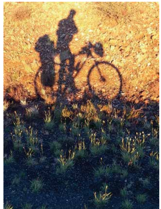
Selfie taken whilst crossing the Great Karoo Eelco Meyjes

The ride took him 44 days of which seven were rest days. Life Lesson: Be flexible, sometimes plan C can be far better than plan A. Ride Lesson: Cycling amongst wildlife.